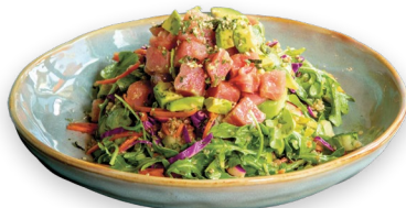
Ahi Poke Salad

Chicken 5 | Salmon 7 | Ahi Poke 7 | Four Grilled Shrimp 5 | Steak 10