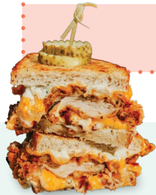
Crispy Chicken Bacon Ranch Melt