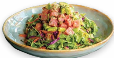
Ahi Poke Salad

Chicken 5 | Salmon 7 | Ahi Poke 7 | Four Grilled Shrimp 5 | Steak 10