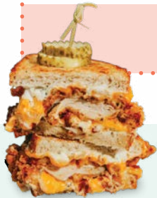
Crispy Chicken Bacon Ranch Melt